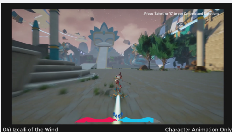
04) IZCALLI of the Wind