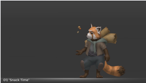
01) "Snack Time"